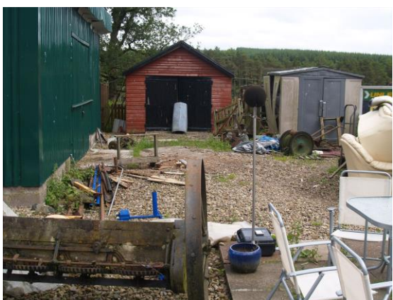
Looking east (2012)