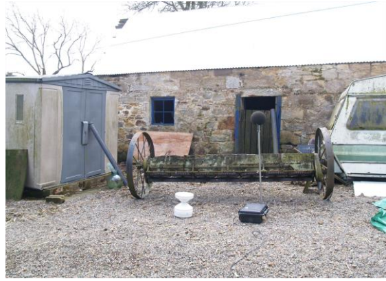
Looking south (2015)