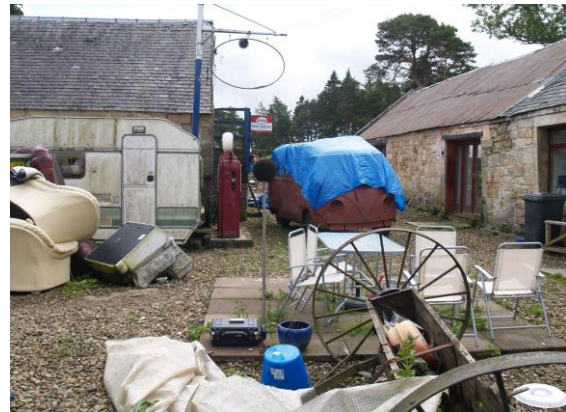
Looking south (2012)