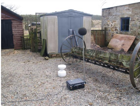
Looking east (2015)