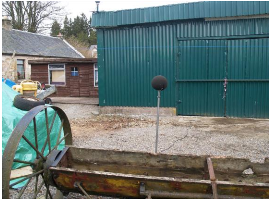
Looking north (2015)