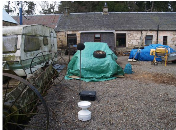
Looking west (2015)