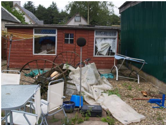
Looking north (2012)