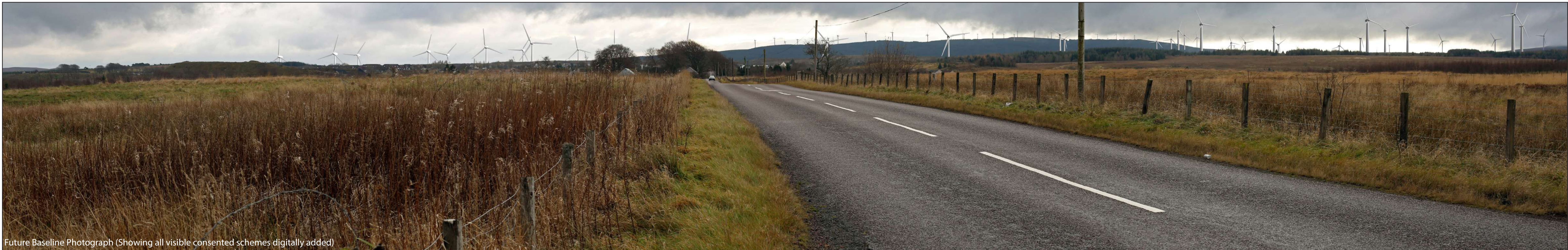
Future Baseline Photograph (Showing all visible consented schemes digitally added)