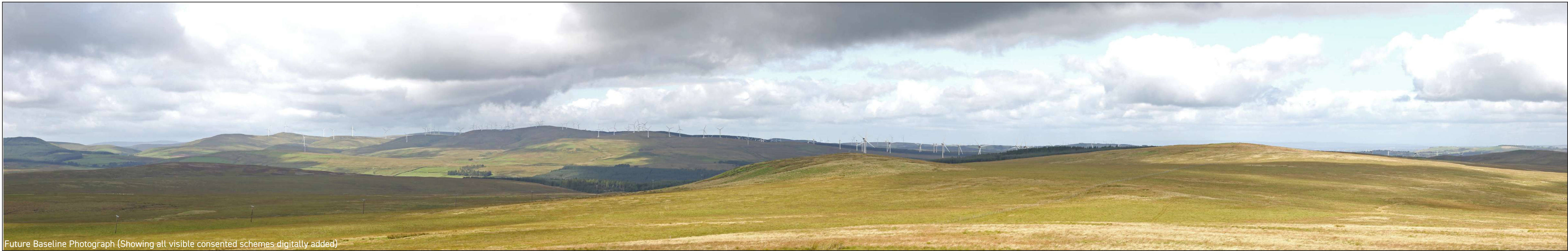
Future Baseline Photograph (Showing all visible consented schemes digitally added)