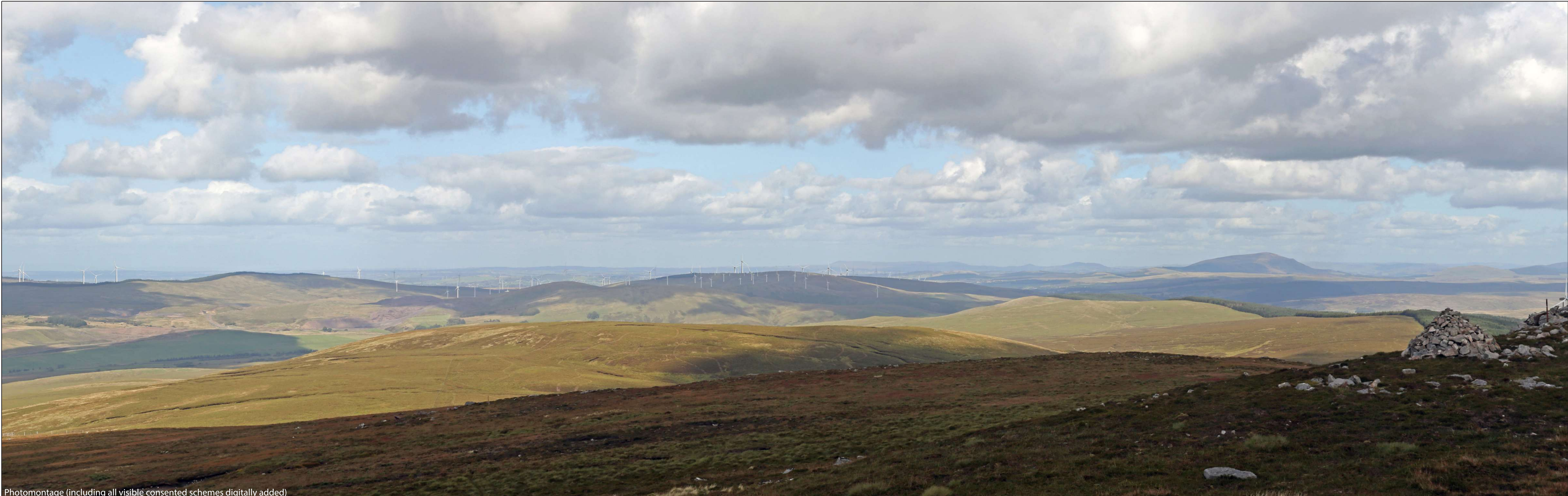
Photomontage (including all visible consented schemes digitally added)