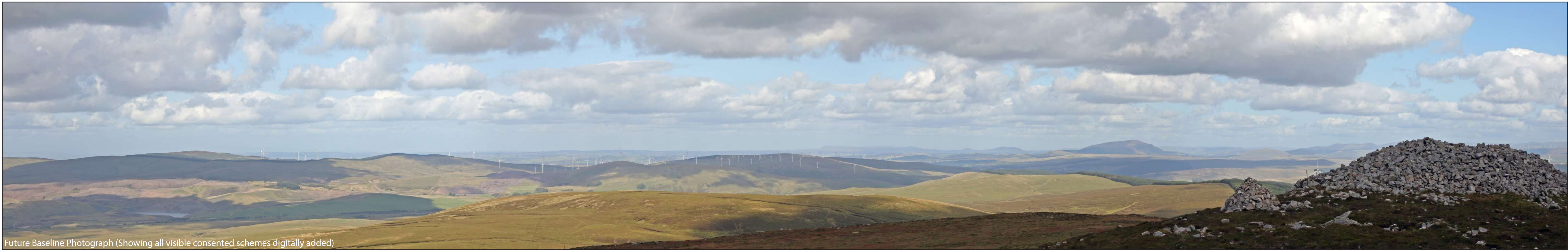
Future Baseline Photograph (Showing all visible consented schemes digitally added)