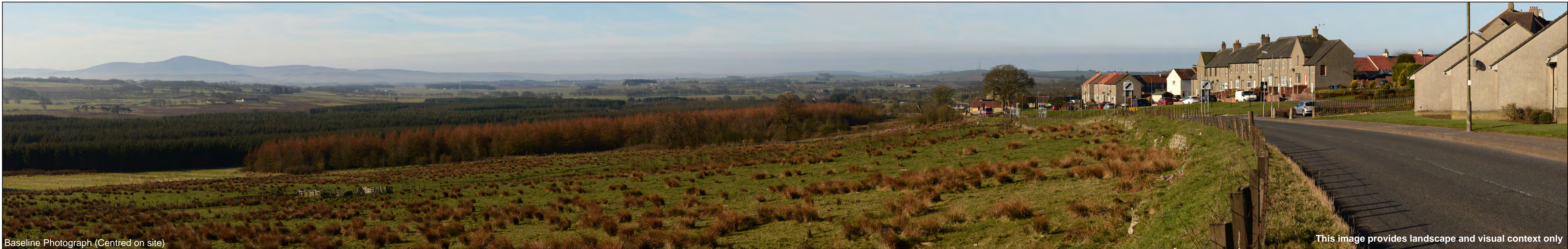
Baseline Photograph (Centred on site)

This image provides landscape and visual context only