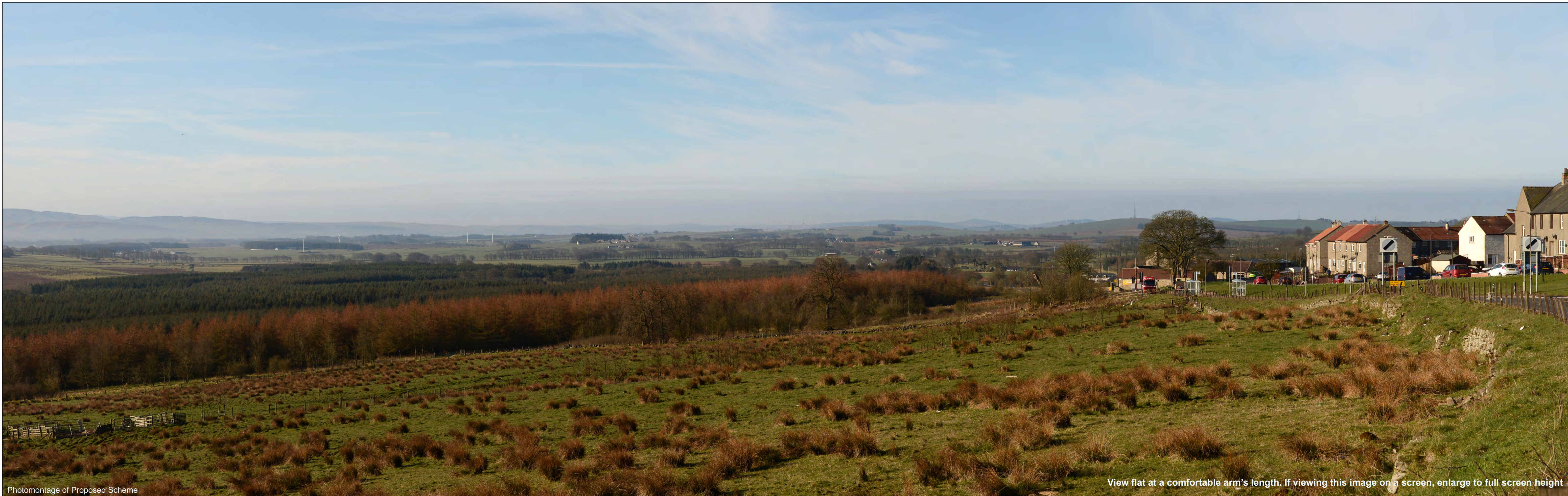
Photomontage of Proposed Scheme

View flat at a comfortable arm's length. If viewing this image on a screen, enlarge to full screen height