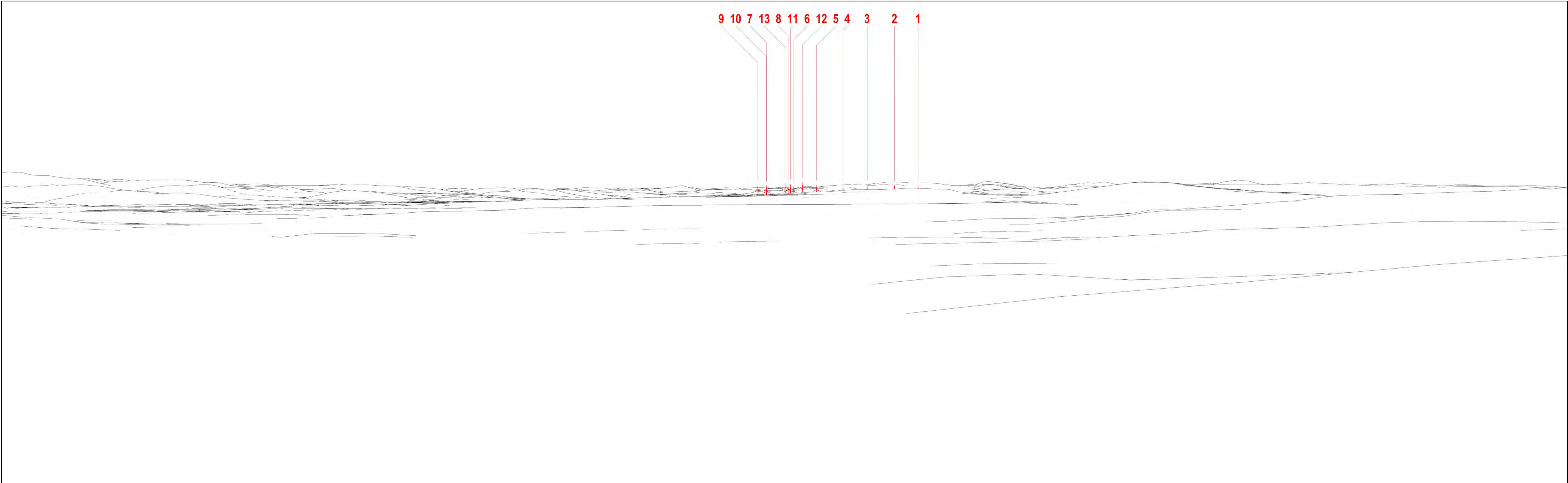
Wireline Drawing of Proposed Scheme