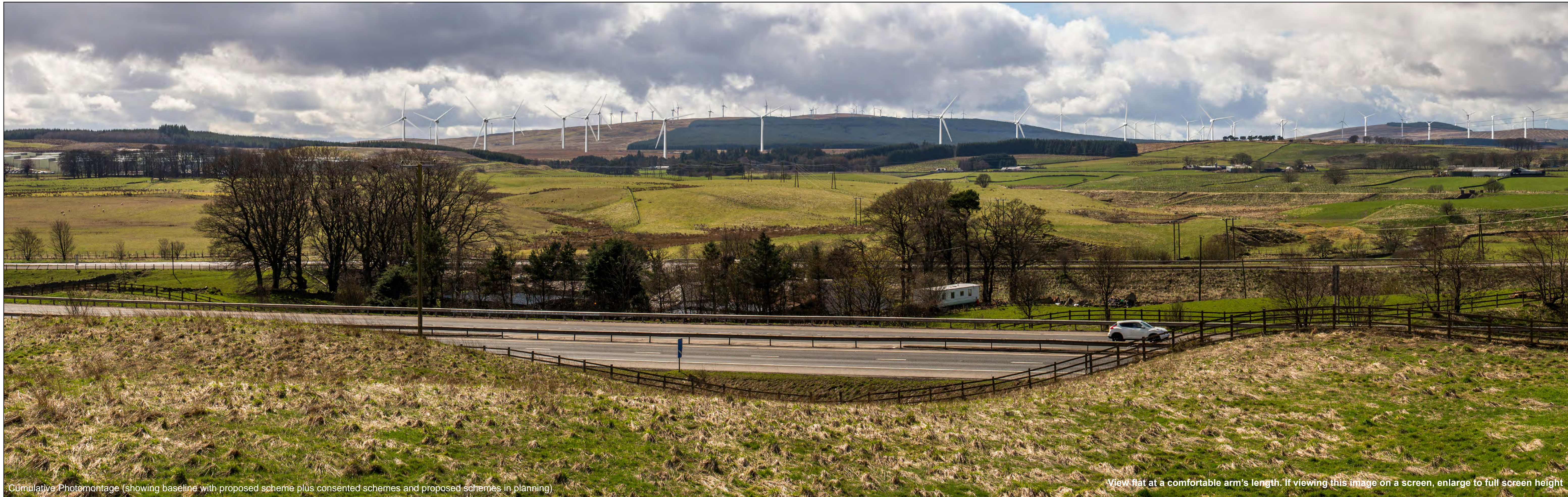
Cumulative Photomontage (showing baseline with proposed scheme plus consented schemes and proposed schemes in planning)

View flat at a comfortable arm's length. If viewing this image on a screen, enlarge to full screen height