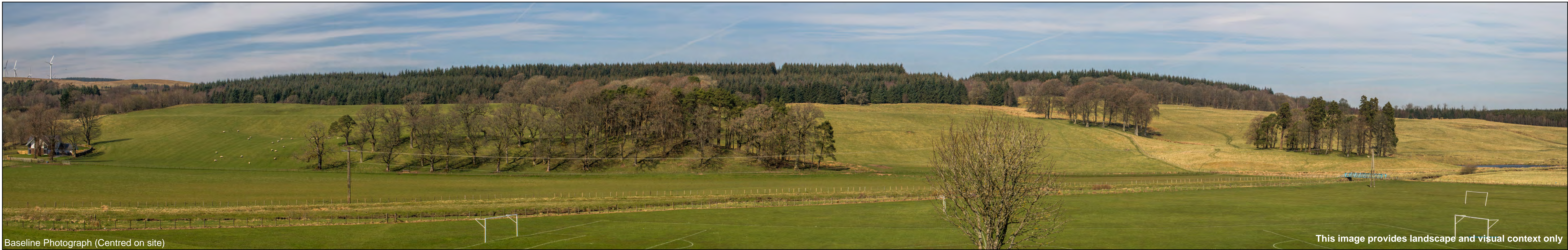
Baseline Photograph (Centred on site)

This image provides landscape and visual context only