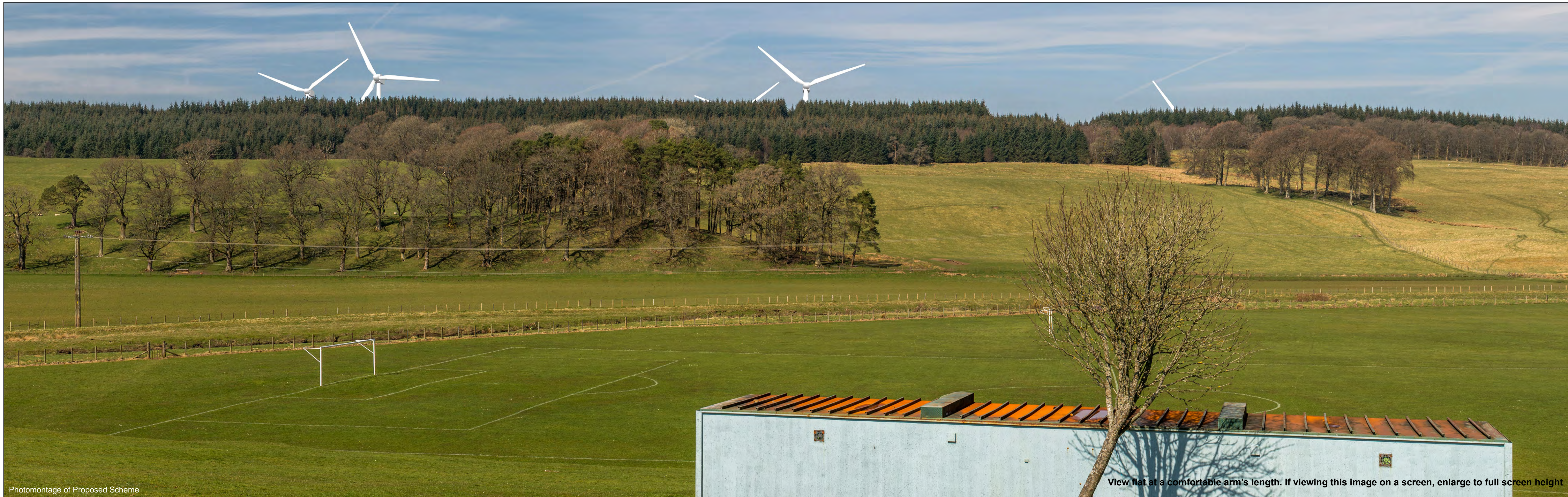
Photomontage of Proposed Scheme

View flat at a comfortable arm's length. If viewing this image on a screen, enlarge to full screen height