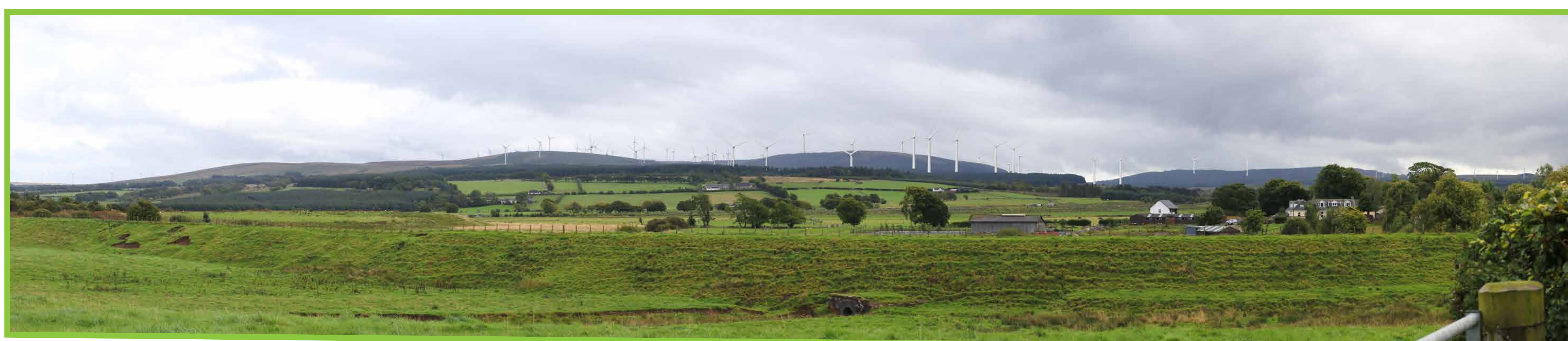
Photomontage showing how the proposed development would look, in combination with all other cumulative projects (except those in Scoping) shown on the wireline above, when looking southeast from Drumclog.