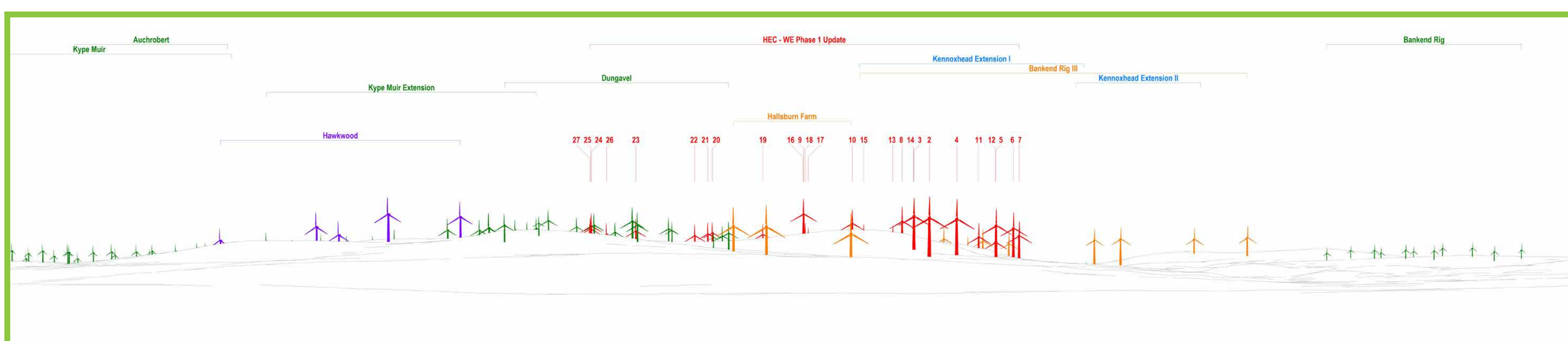
Cumulative bare-earth wireline view looking southeast from Drumclog showing the proposed development turbines in red, consented but not yet built turbines in blue, operational/under construction turbines in green, in-planning turbines in orange, and Scoping stage turbines in purple.