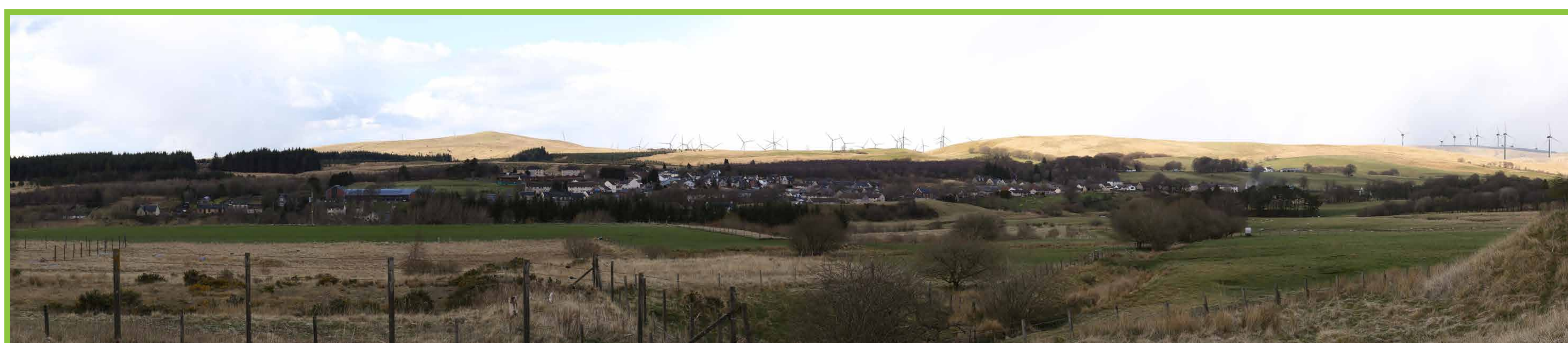
Photomontage showing how the proposed development would look, in combination with all other cumulative projects (except those in Scoping) shown on the wireline above, when looking north from The River Ayr Way.