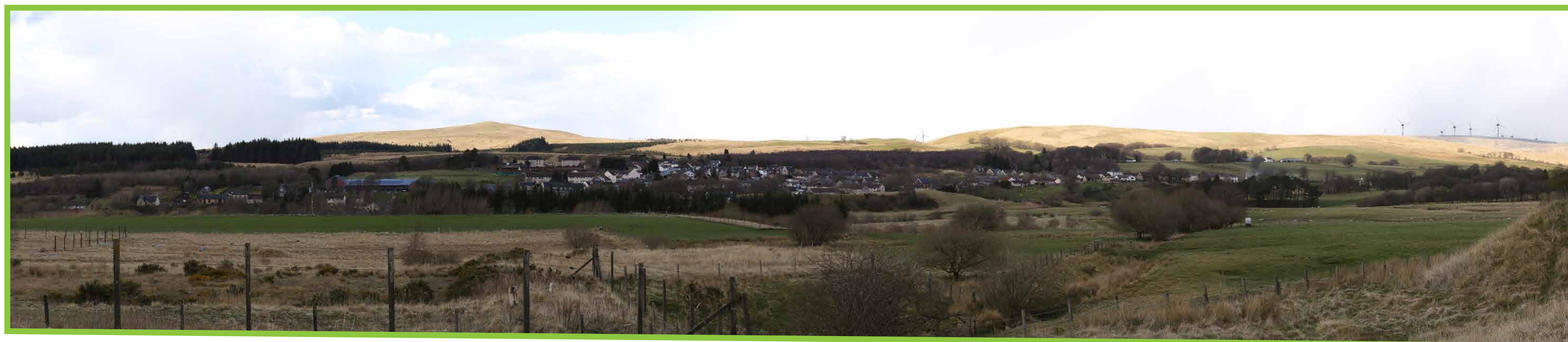
Baseline photograph showing the current view looking north from the River Ayr Way south of Muirkirk.