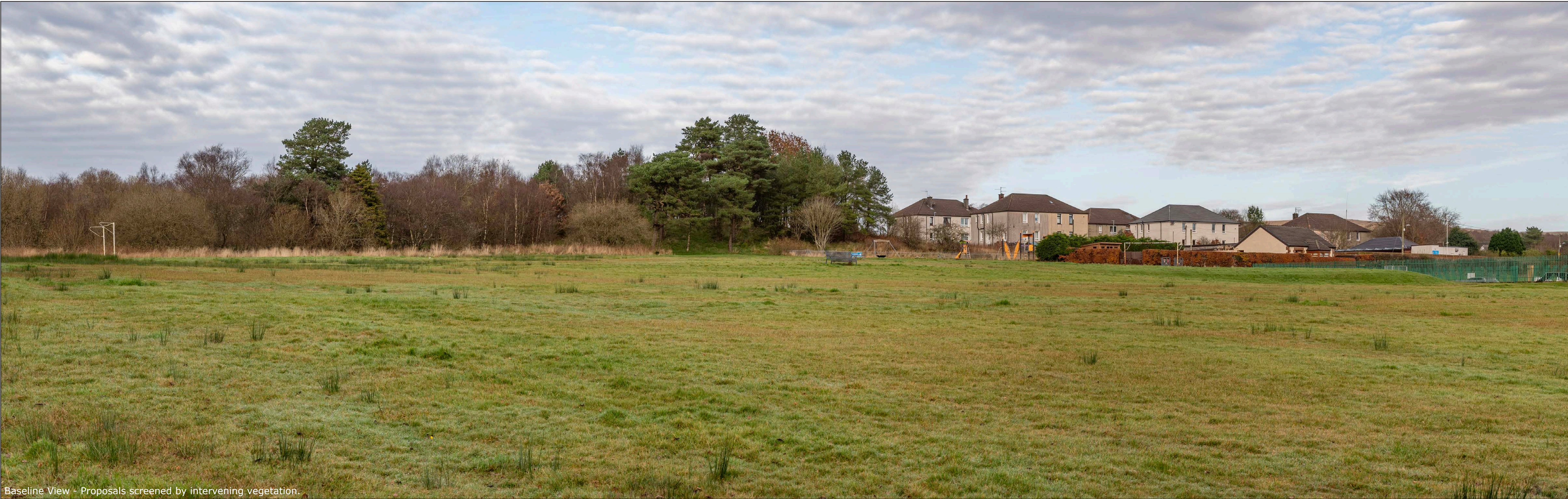
Baseline View - Proposals screened by intervening vegetation.