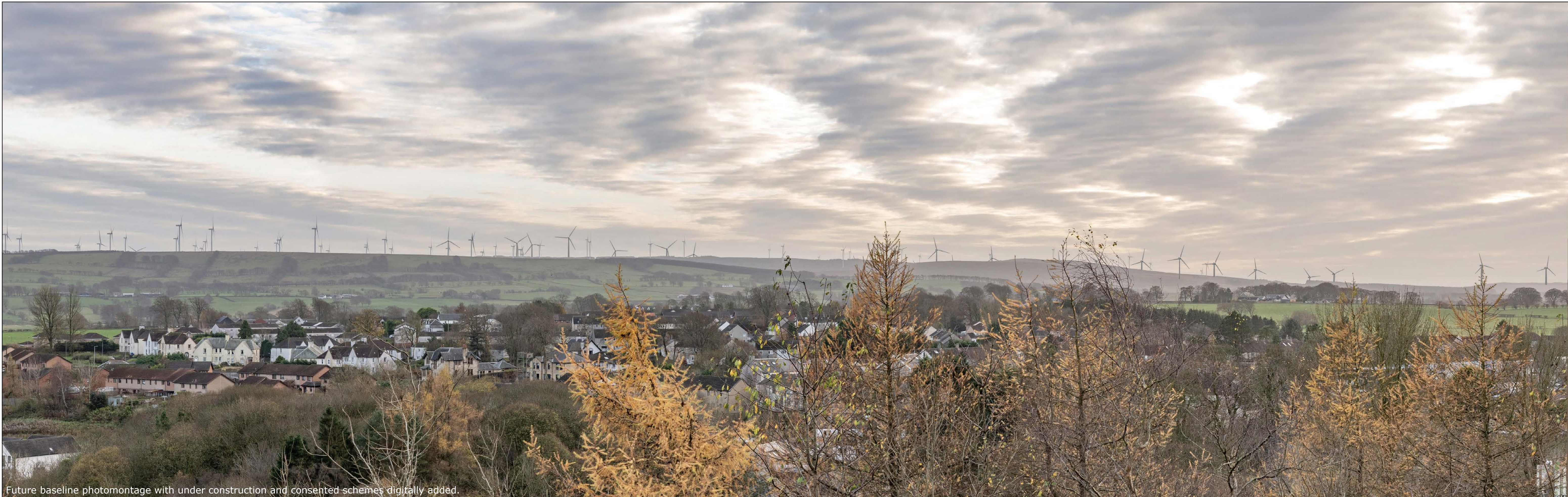
Future baseline photomontage with under construction and consented schemes digitally added.

Viewpoint Information OS Reference: E270455 N644639 Distance to nearest turbine: 9,204m (T16) Angle of view: 53.5° (planar) Camera: Nikon Z6ii Ground level: 199m (AOD) Bearing to centre of photograph: 188.75° Principal distance: 812.5mm Lens: 50mm Fixed Focal Lens Paper size: 841 x 297 mm (half A1) Height: 1.5m Correct printed image size: 820 x 260mm Date & Time: 11/11/2024 15:25