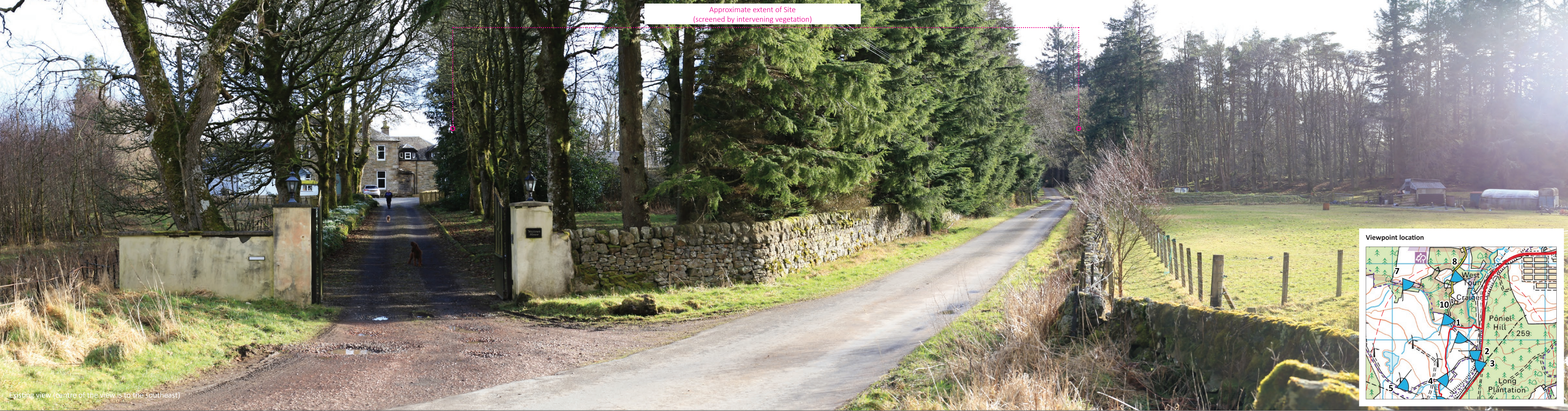
Existing view (centre of the view is to the southeast)